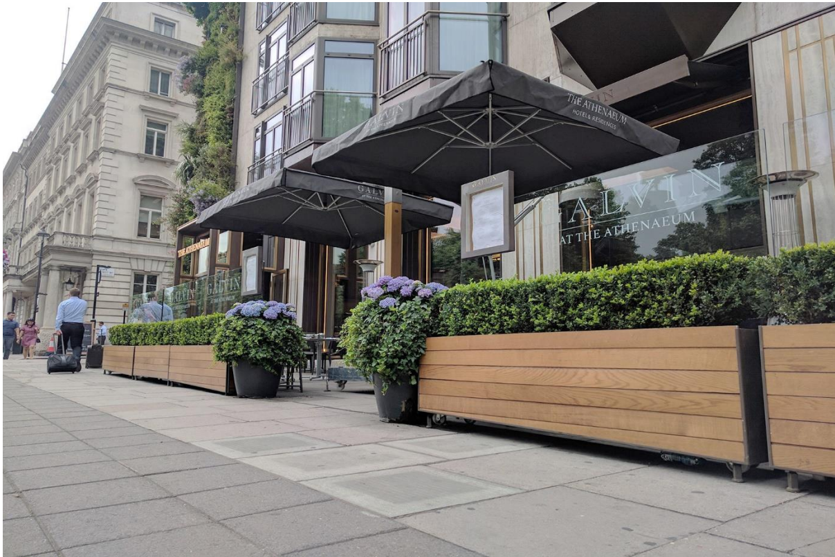
Terrafirma Duo 6x3 - Athenaeum Hotel London SHADEmakers UK