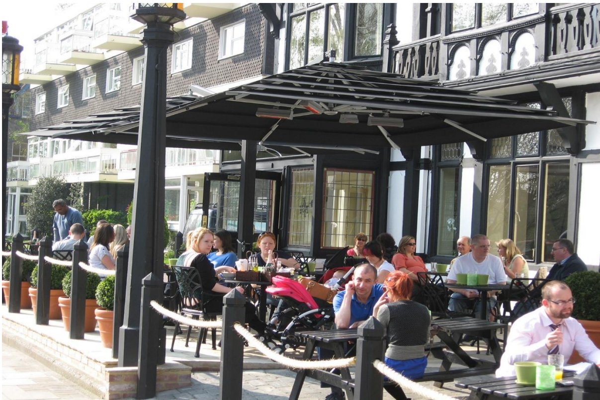
Terrafirma Duo 8x4 Louver - Bedford UK SHADEmakers UK